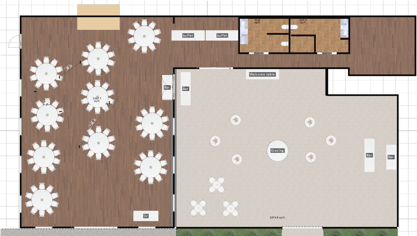
100 Seated Guests, Buffet Service assumes cocktail hour will be held in the courtyard