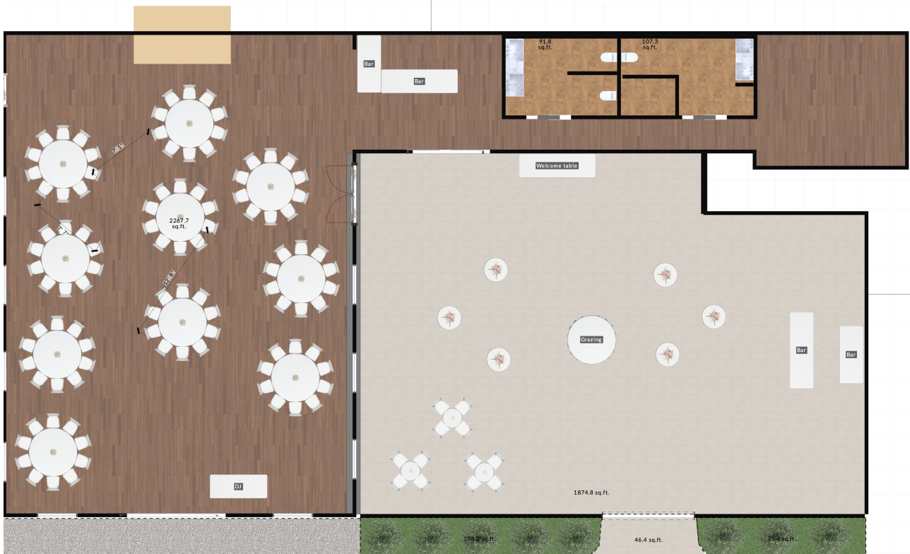
100 Seated Guests, Plated or Family Style Service assumes cocktail hour will be held in the courtyard