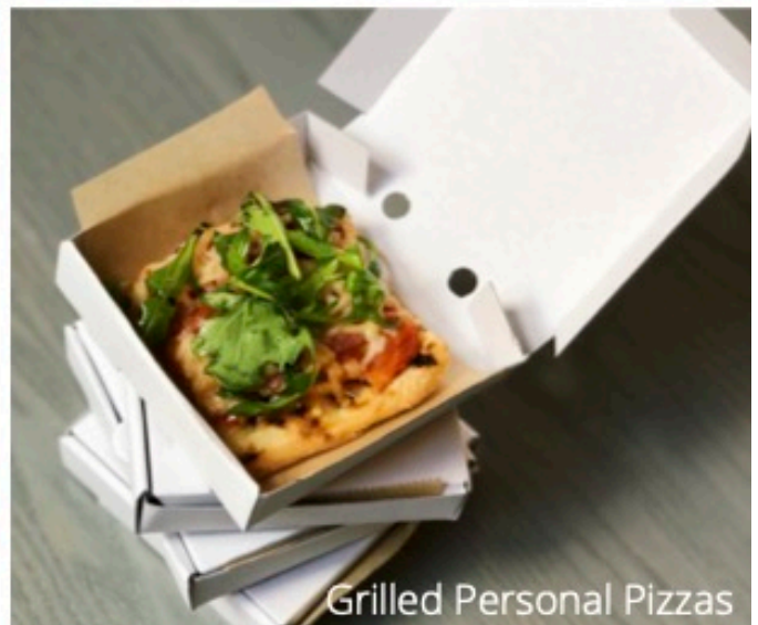
Grilled Personal Pizzas