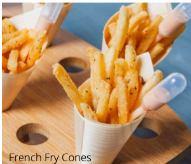
French Fry Cones