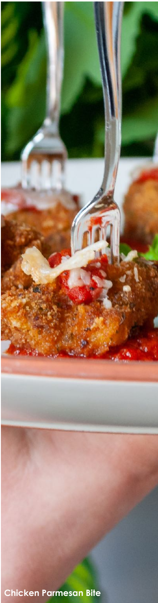
Chicken Parmesan Bite

note: these are just samples, menu choices can be tailored to your preferences, but that may adjust costs based on what you select. Please note these prices do not include the rental site fee paid to Athenaeum for your rental.