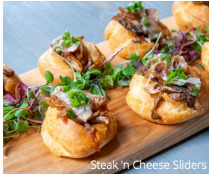
Steak 'n Cheese Sliders