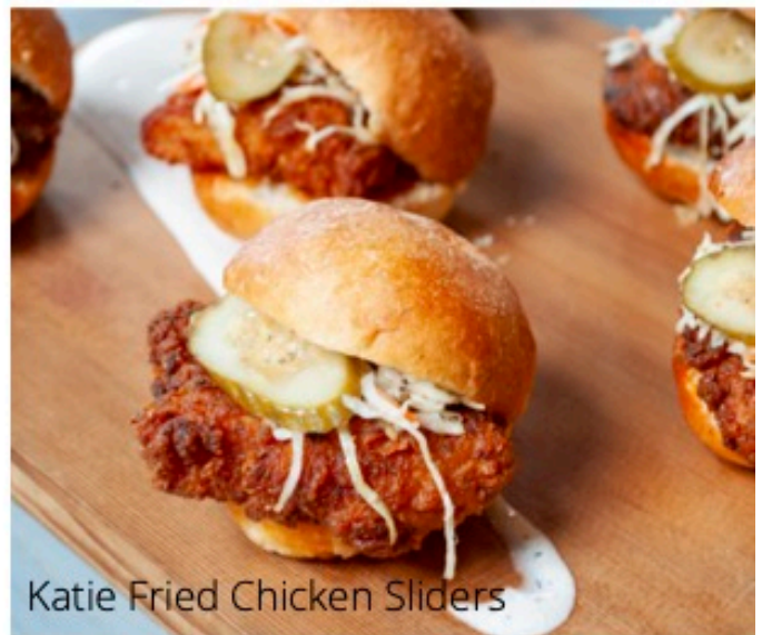
Katie Fried Chicken Sliders